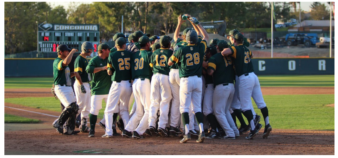
PICTURED ABOVE:-Eagles celebrate walk off victory in the 2018 season.